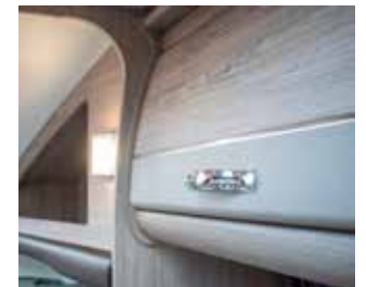
Coachbuilt models provide plenty of spaces to store your luggage and touring equipment.