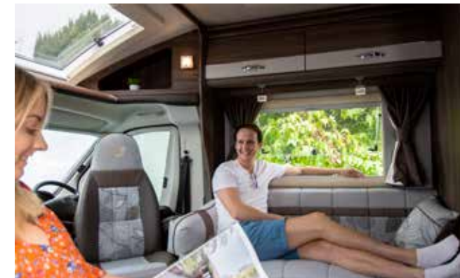
Coachbuilt models provide plenty of spaces to store your luggage and touring equipment.