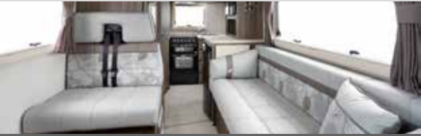
Additional Rear Travelling Seats