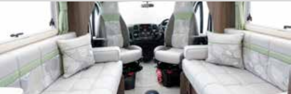
Twin Bench Lounge

Selected Coachbuilt models are available with the option of two rear seating configurations. Choose from either twin benches, creating a spacious lounge or additional rear travelling seats**, which allow for extra passengers to be transported in the rear safely.