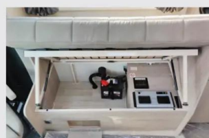
Slats stay up, even with the sturdy settee cushions still in position