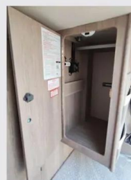
RIGHT At the foot of each bed is a cantilevered wardrobe