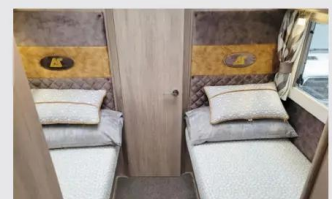
Single beds have padded headboards, as well as mains sockets and USBs