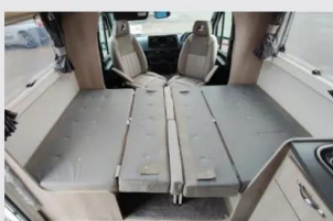
Settees in the front lounge make up a comfortable double bed