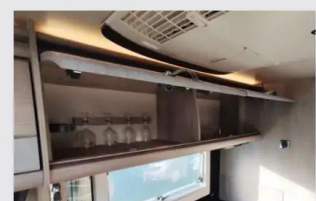
One overhead locker in the kitchen houses a set of branded wineglasses