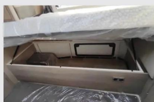
Lift the slats to reach storage areas; offside one has outside access, too