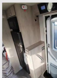
LEFT Table stows away in cupboard by habitation door