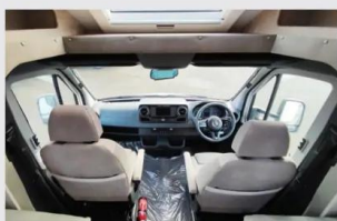
Pared-down cab, but Premium Pack adds nine-speed gearbox and more