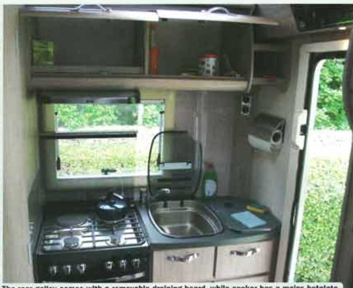
The rear galley comes with a removable draining board, while cooker has a mains hotplate