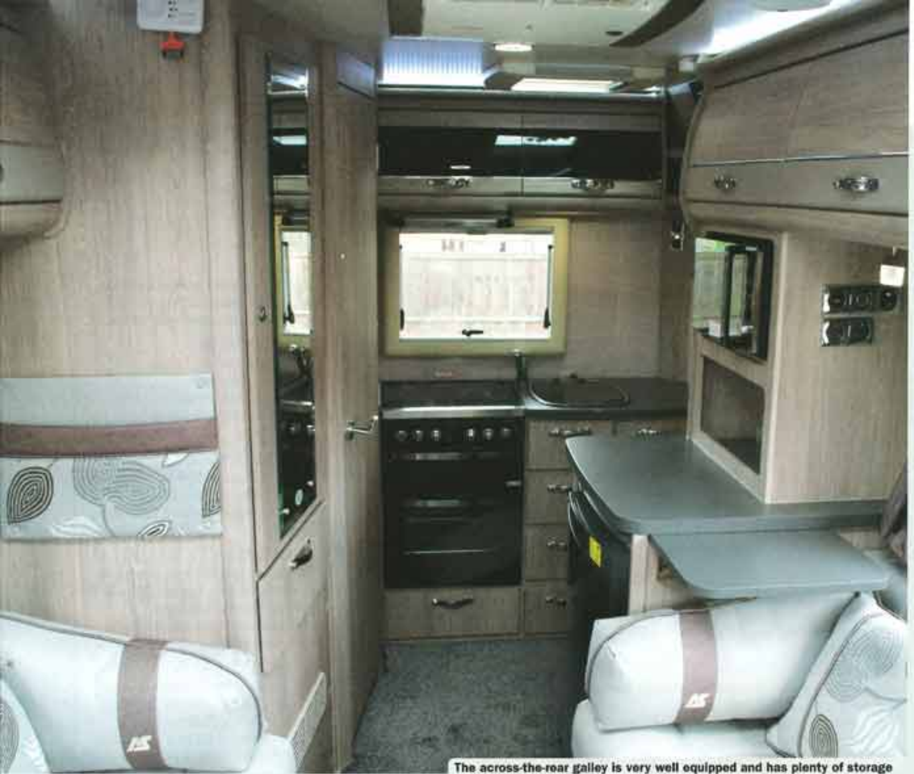
The across-the-rear galley is very well equipped and has plenty of storage