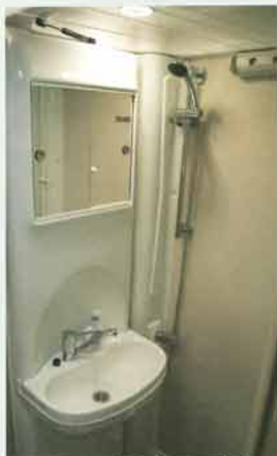
The basin and cabinet swing through 90 degrees to create a shower cubicle