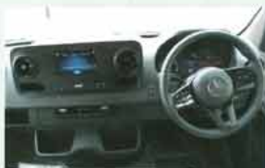
The MBUX screen is the focal point of the latest Sprinter cab