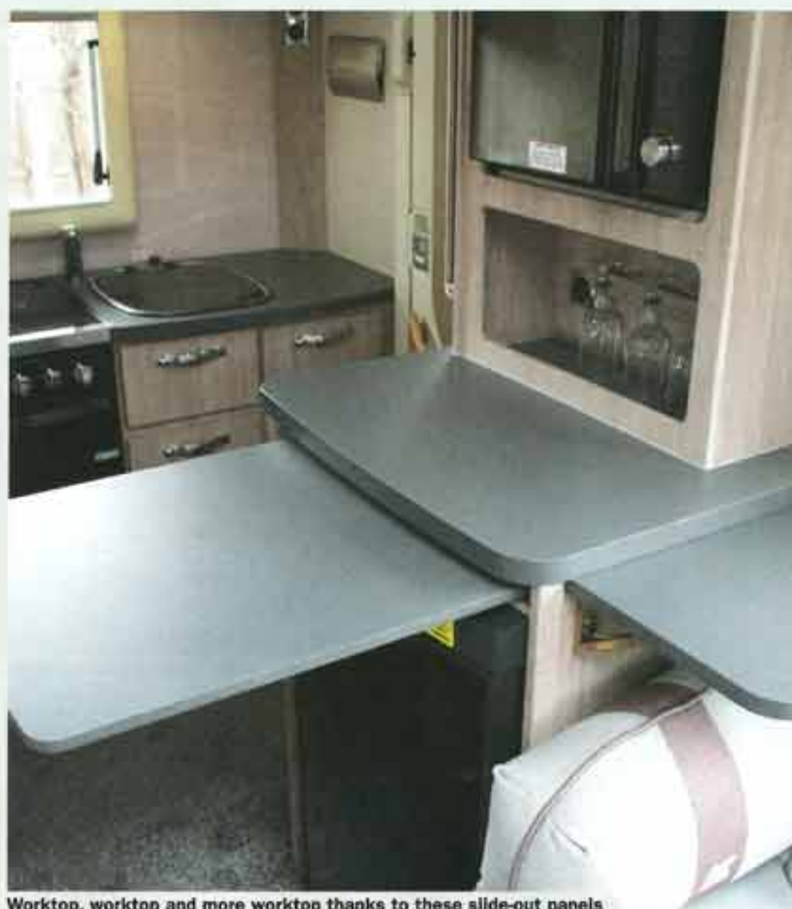
Worktop, worktop and more worktop thanks to these slide-out panels

These cupboards are either split horizontally with a fixed shelf, or unsplit to accommodate bulkier items.