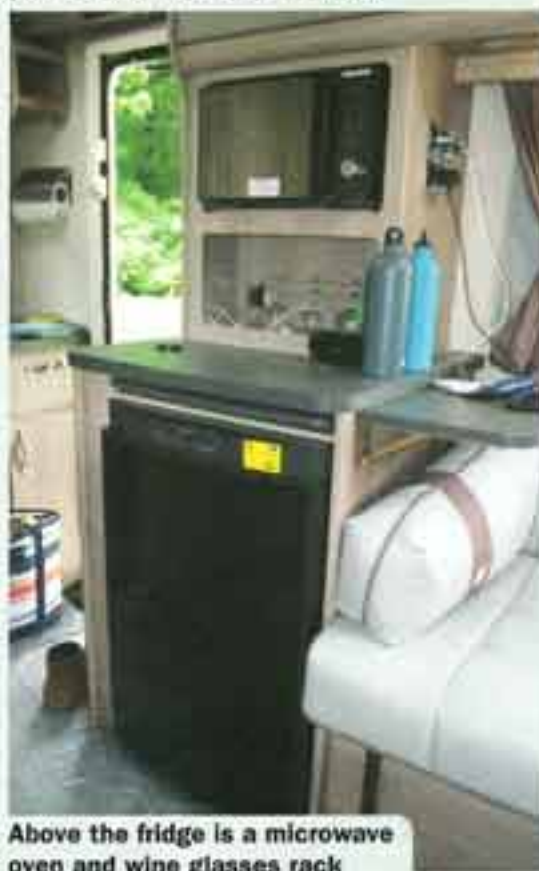
Above the fridge is a microwave oven and wine glasses rack