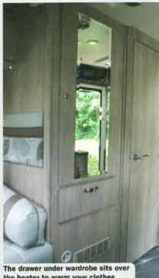
The drawer under wardrobe sits over the heater to warm your clothes