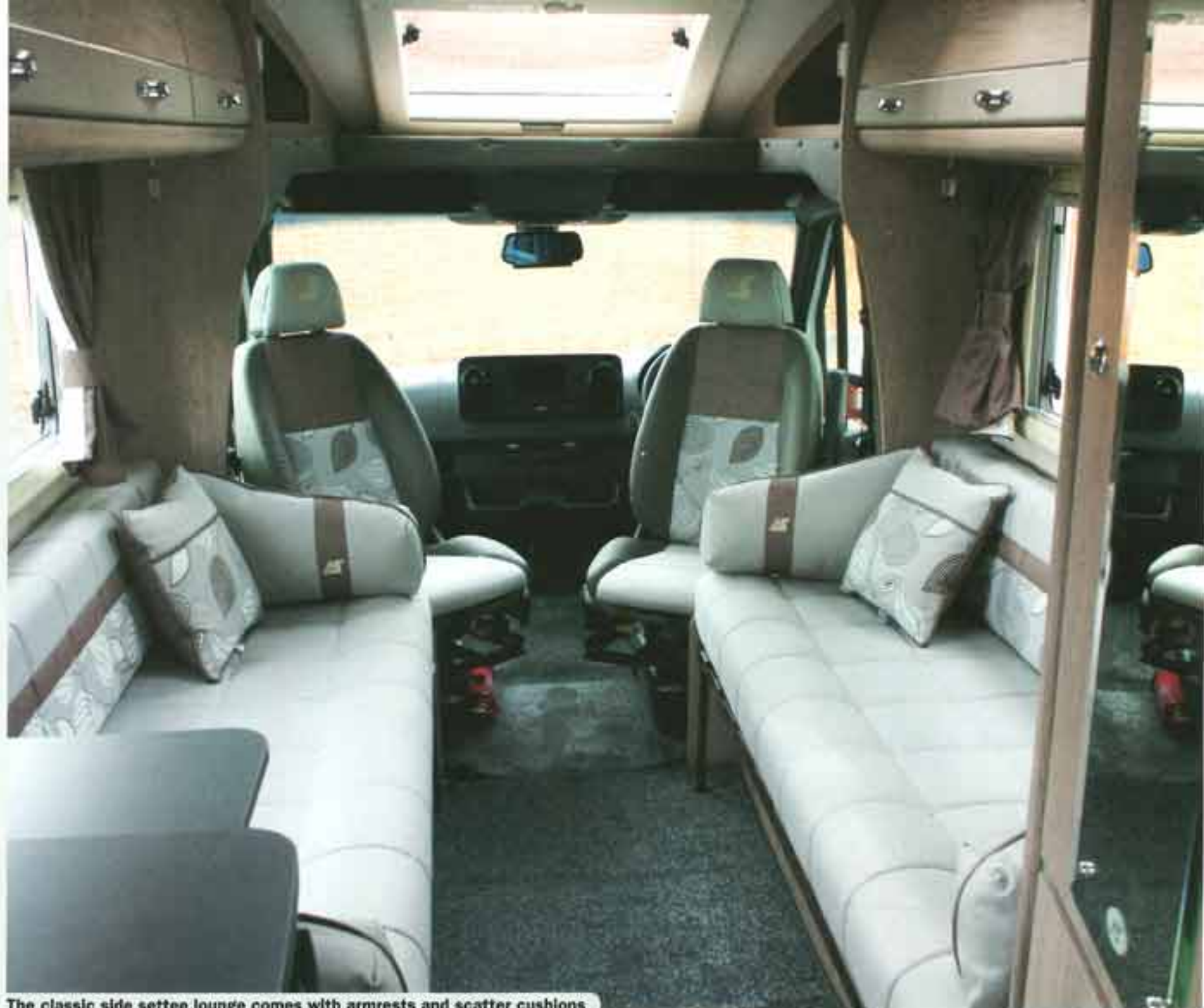
The classic side settee lounge comes with armrests and scatter cushions

The first thing you notice about the Auto-Sleeper Bourton is the Mercedes badge. Where Fiat grille logos are regularly replaced by motorhome manufacturer motifs, the famous star is proudly retained.