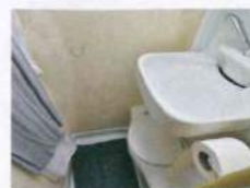
The washroom is inevitably small, with a basic shower, flush loo and tip-up basin

Washroom The side washroom is as you go in by the main sliding entry door. It's understandably small. You can shower in it, but we used site facilities instead. It has a fixed electric flush cassette loo below a small moulded vanity unit with a tip-up sink. The LED light is bright, and although no window is fitted, a roof vent allows in natural light and adds to the air flow. The washroom is not fully lined, so it isn't as easy to wipe down as a fully lined unit.