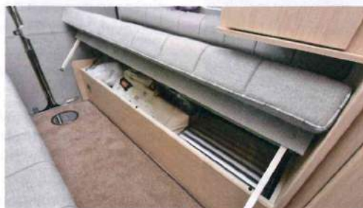
The hob has an oven/grill; the nearside seat base offers storage