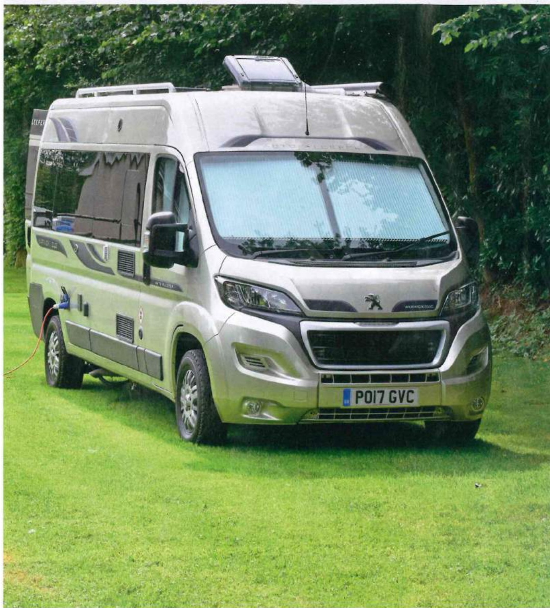
The Duo looked good on our grass pitch at Moorhampton, one of our favourite sites, and passers-by weren't slow to let us know it!

set up by pulling out the two seat base frames to create the bed base – all easy to do, and completed in less than a minute.